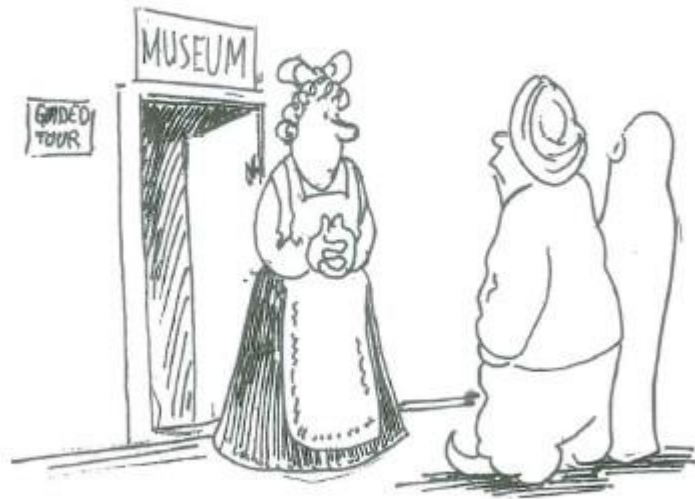
THE CHALLENGES OF CULTURAL CHANGE